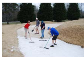
Member Work Day