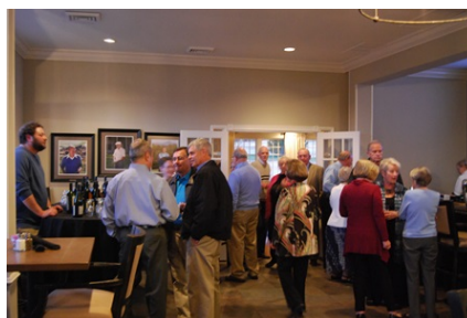
Wine Tasting Dinner