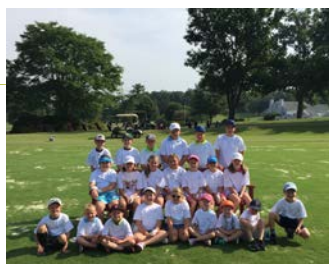
2016 Junior Golf Clinic Participants (1) Of two Junior Golf Clinics held at MH