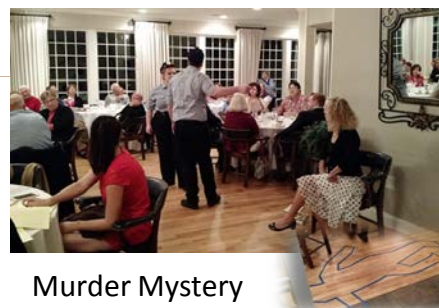
Murder Mystery Dinner Theater