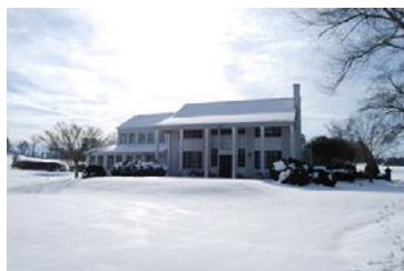
8-10" snow January 22