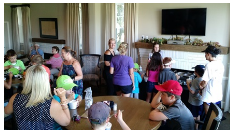
Celebrating July National Ice Cream Month!