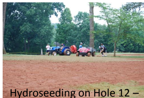
Hydroseeding on Hole 12 –

Preservation Club begins in 2015. Repairs were made on Hole 9 in 2015. Pictures not available.