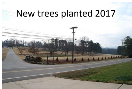
New trees planted 2017