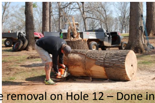
Tree removal on Hole 12 – Done in 2016