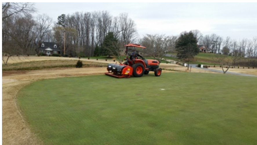
Deep Tine Aerifier